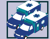
Hospital Fleet Complete