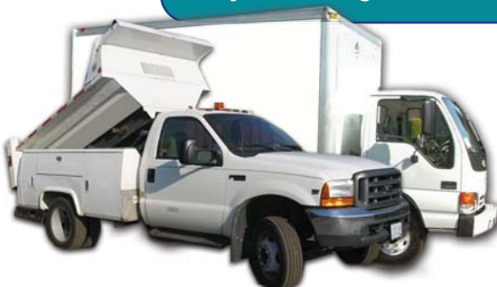
other hospital vehicles covered by Hospital Fleet Complete